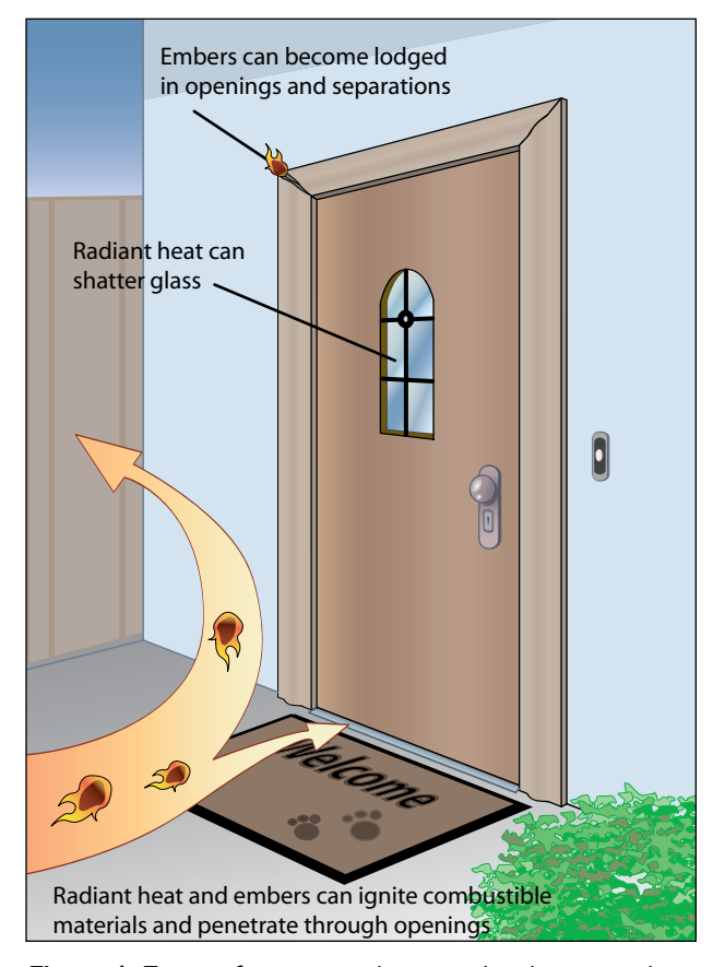
Figure 1. Types of exposure that exterior doors can be subject to in a wildfire.